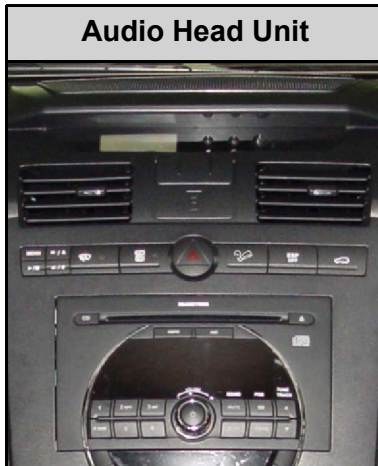
Audio Head Unit