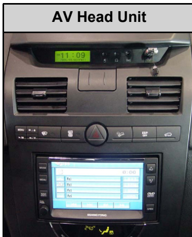
AV Head Unit

The integrated type antenna is not available.